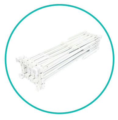
QTY 1: 4x3 Pop Up Frame

• 34 1/8" L x 8" W x 7 1/4" H (Collapse Frame)