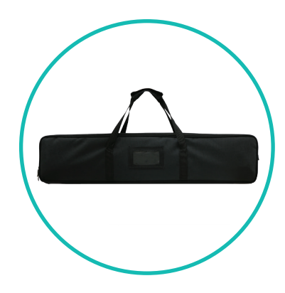
QTY 1: Edge Light Travel Bag

Outside Dimensions: • 28" L x 6" W x 7 1/4" H Inside Dimensions: • 28 1/4" L x 6 1/8" W x 6 3/4" H