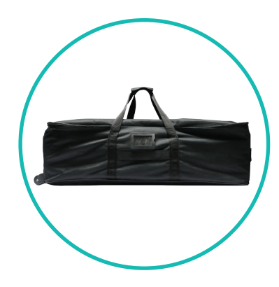
QTY 1: Travel Bag with Wheels