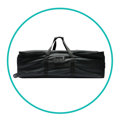
QTY 1: Travel Bag with Wheels

Outside Dimensions: • 35" L x 13" W x 10" H Inside Dimensions: