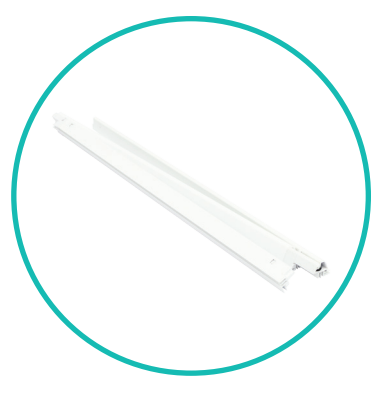
QTY 8: 3 Sectional Channel Bars

• 34 1/8" L x 6 1/2" W x 7 1/4" H (Collapse Frame)