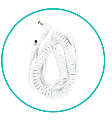
QTY 3: Edge Light Jumper Cords