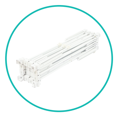
QTY 1: 3x3 Pop Up Frame

• 34 1/8" L x 6 1/2" W x 7 1/4" H (Collapse Frame)