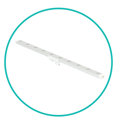
QTY 6: Edge Lights

Outside Dimensions: • 28" L x 6" W x 7 1/4" H Inside Dimensions: • 28 1/4" L x 6 1/8" W x 6 3/4" H