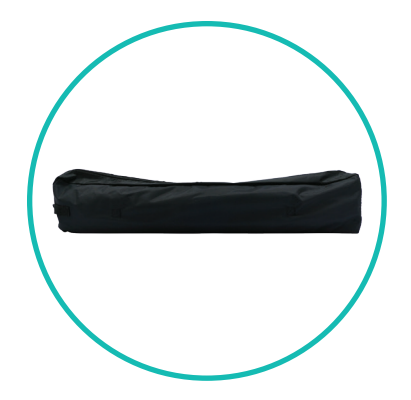
QTY 1: Channel Bar Bag

• 85 7/8" L x 1 1/16" W (When assembled)