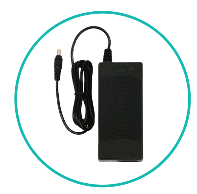
QTY 3: Transformers

• 5 1/8" L x 2 1/4" W x 1 1/4" H (Transformer) • 58" L (Cord Length)