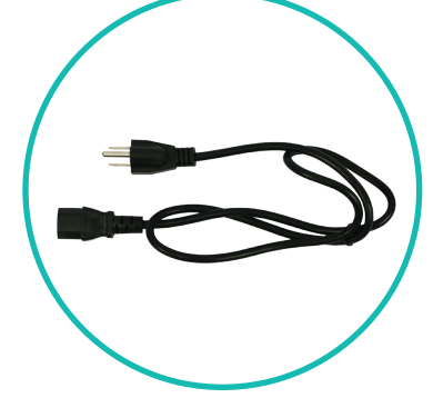
QTY 3: Power Cords

• 5 1/8" L x 2 1/4" W x 1 1/4" H (Transformer) • 58" L (Cord Length)