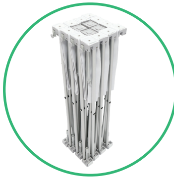
QTY 1: Frame w/ Pre-Installed Graphic

• 9 1/4" L x 10 3/4" W x 31 1/4" H (Collapse Frame)