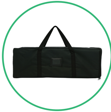
QTY 1: Black Nylon Carry Bag